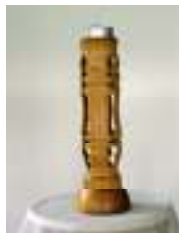
Inside Out Candle Stick Holder Nico Groenewald