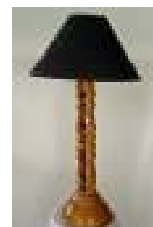
Inside Out Lamp Nico Groenewald