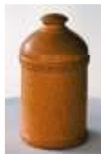
Toothpick Holder in Beech Rowan Swinnerton