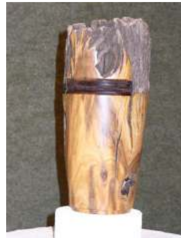
The Open Vase turned from sneezewood